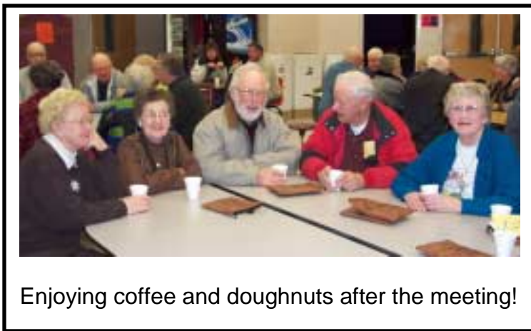
Enjoying coffee and doughnuts after the meeting!