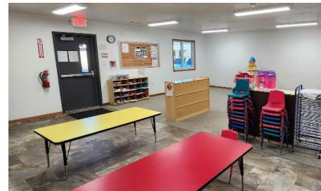
BELOW: New classroom added as part of the expansion project.